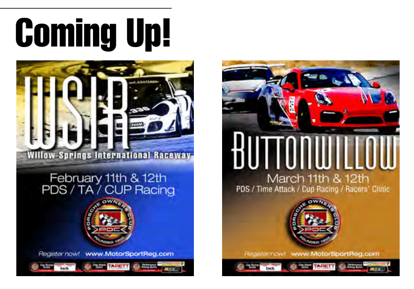
Register today at MotorSport Reg.com